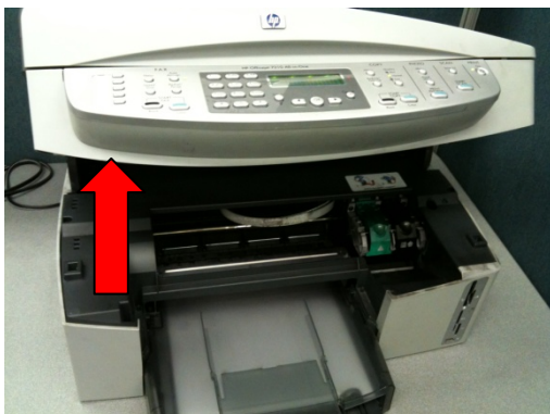
Lift top cover.