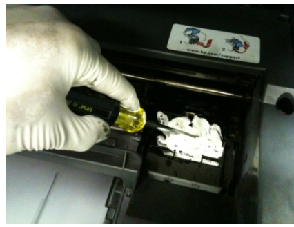
Wipe away excess fluids.