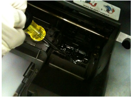
Remove build-up with a flat screwdriver.