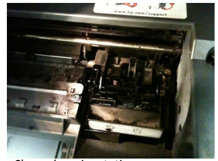
Cleaned service station.