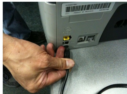
Unplug power cord.