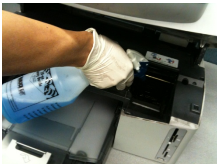
Clean with Windex (or tap water).