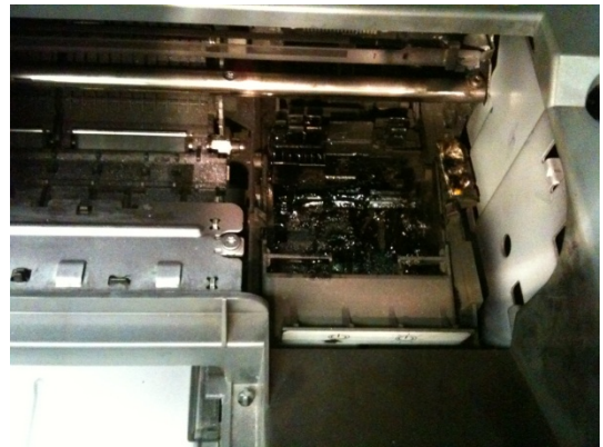
Partially cleaned service station.